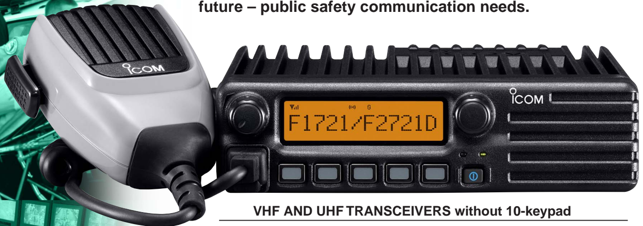
VHF AND UHF TRANSCEIVERS without 10-keypad

For organizations who run an analog radio system and must migrate to a conventional P25 digital system, Icom provides one of the best solutions. The new F1721D series mobile allows you to program P25 digital and/or FM analog mode per channel. Flash ROM capability means future upgrades and flexible customization, tailored for your system. Moreover, built-in multiple tone signaling capability and an optional voice scrambler satisfy existing analog FM system requirements. This new Icom's frequency coverage and rugged construction ensures a flexible, long life radio for you. Icom is the smart choice for current – and future – public safety communication needs.