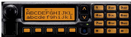
Two line setting display example

Using a high contrast LCD, the IC-F1721/F1821 series shows operating channels, tone and other settings clearly under nearly any lighting conditions. With a dot matrix display, upper and lower case characters can be easily distinguished. In addition, you can change the display setting to show one line and 12 characters, or two lines and 24 characters via programming.