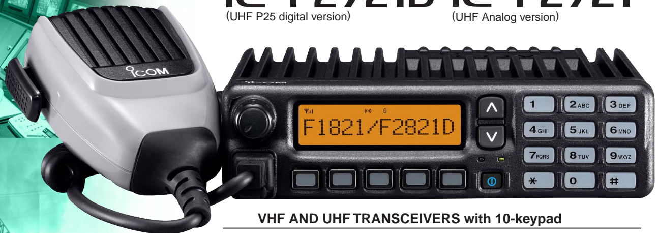
VHF AND UHF TRANSCEIVERS with 10-keypad